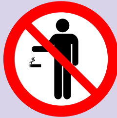
Dropping cigarette end £150 fine