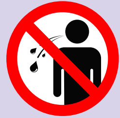
Spitting £150 fine