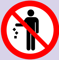
Dropping litter £150 fine

You can get a fixed penalty notice (FPN) for environmental offences including: