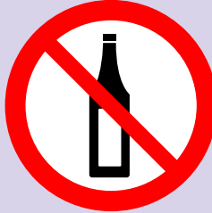
Drinking alcohol in public £100 fine