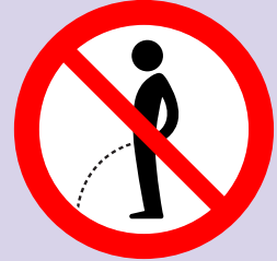
Urinating in public £150 fine

It is important to know that not knowing the law or being new into the UK is NOT a defence if you are issued an FPN. If you do not pay the FPN you will be summoned to court and if found guilty you will receive a criminal record.