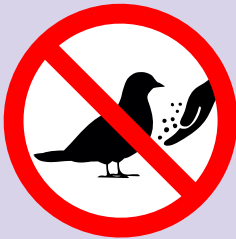
Feeding pigeons £150 fine