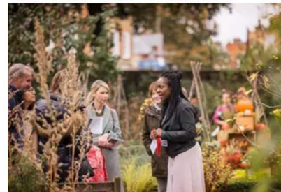
Inclusion, access and participation