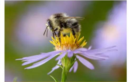
Protecting the environment