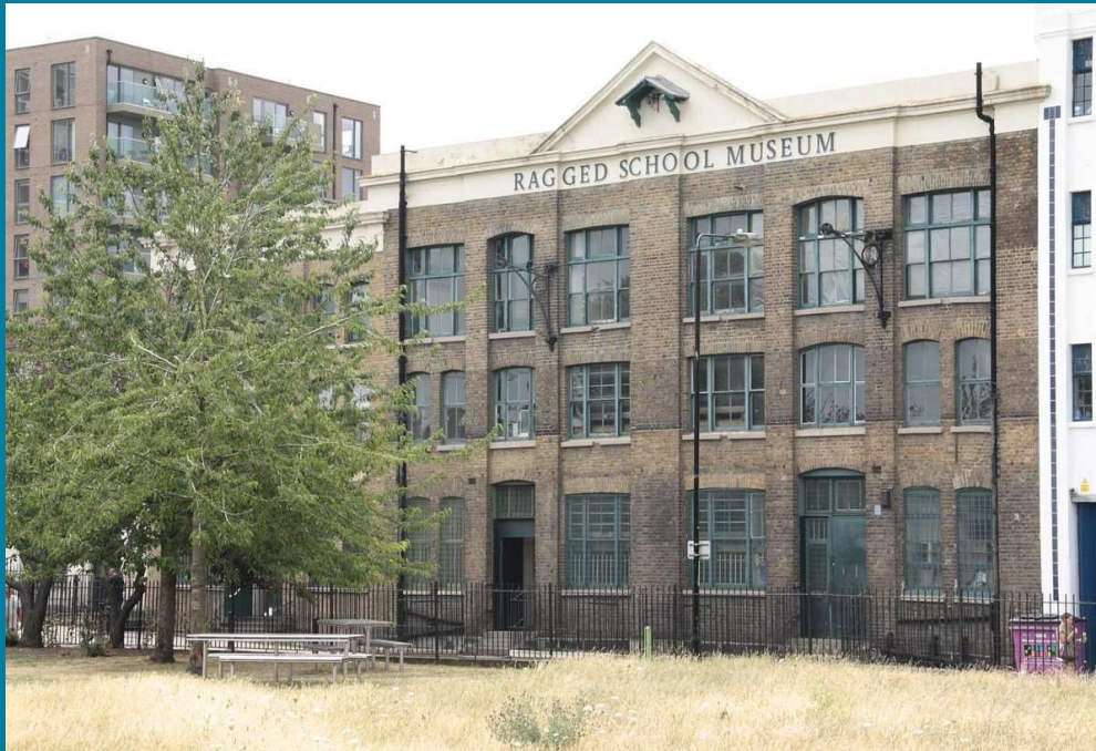
The Ragged School Museum