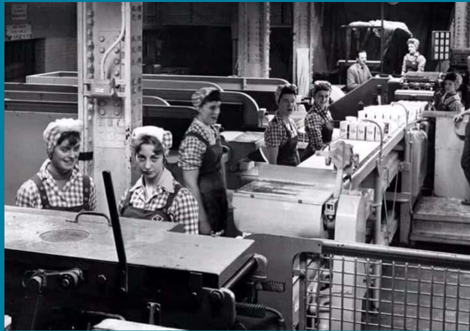
Sugar Girls, The Women Workers of Tate & Lyle Factory, Silvertown